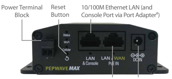
10/100M Ethernet LAN 12V – 28V (usable as WAN) DC Jack